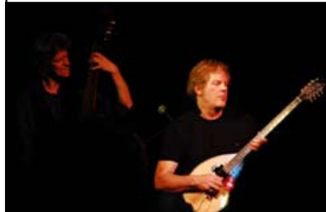
YEAR'S APRIL IN PARIS FESTIVAL

tional feature "Head in the Clouds" alongside Penelope Cruz and Charlize Theron . "That was a fantastic experience – and so much fun to be paid to study his recordings and replicate them!"