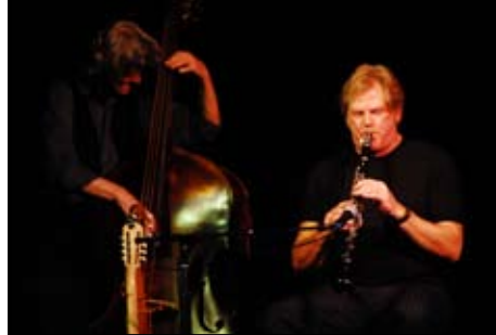
CLARINET, AND BOUZOUKI AT LAST