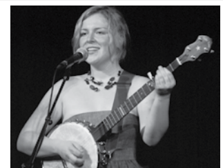
Rogue 2012 Calendar