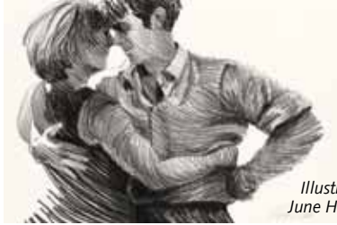
Illustration: June Harman