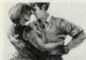
Illustration: June Harman