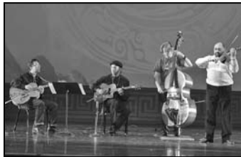
The Roma Swing Ensemble