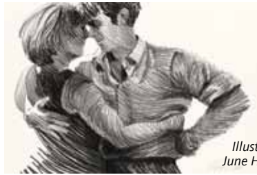
Illustration: June Harman