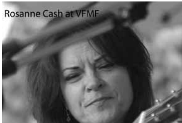
Rosanne Cash at VFME