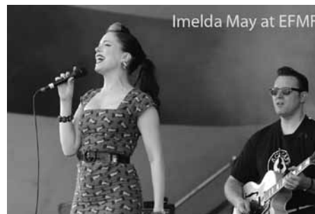
Imelda May at EFMF

The Edmonton Folk Music Festival is the Rolls Royce of folk festivals, and seems to outdo itself annually, and set new standards of excellence in everything from the music to the site, organization, overall quality - and sheer class. The festival started on Thursday night with a monumental set of rockabilly from Dublin singer Imelda May . What a voice she has! And how different she sounds when she speaks in the broadest Dublin accent. Her husband,